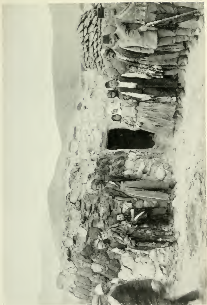
ENTRANCE TO AN UNDERGROUND HOUSE